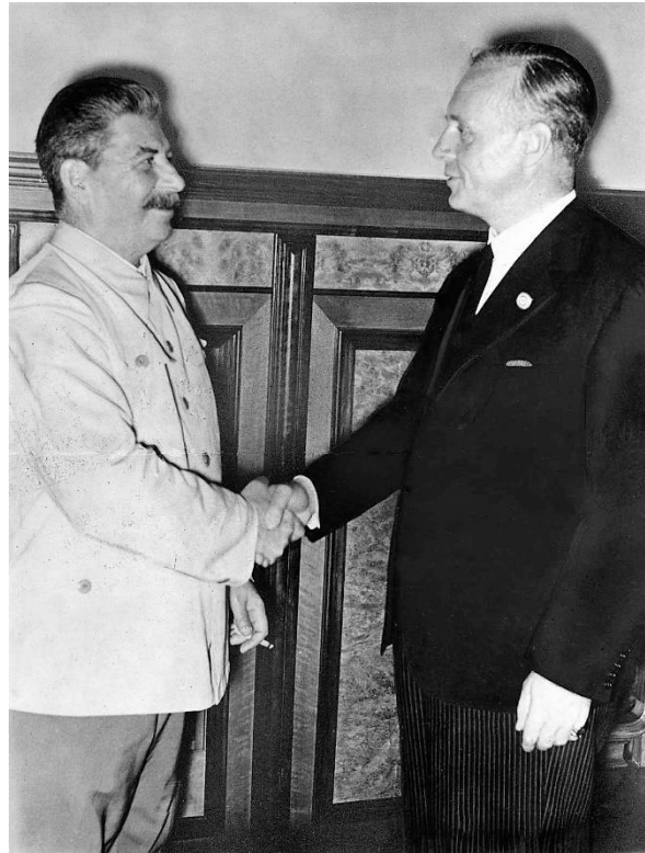
J. Stalin and J. von Ribbentrop, after signing the Nazi-Soviet Non-aggression Pact in Kremlin, Moscow, August 23, 1939

The Molotov-Ribbentrop Pact is the commonly used name of the treaty signed by the German foreign minister Joachim von Ribbentrop and the Soviet foreign minister Vyacheslav Molotov. Officially its name was the Treaty of Non-aggression between the German Third Reich and the Union of Soviet Socialist Republics (USSR) , signed on August 23 rd late evening in Moscow, and it constituted the most important secret arrangement leading to the start of World War II. This war claimed between 50 and 80 million lives, including those brutally murdered by both signatories.